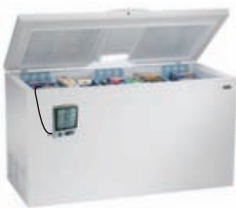
Air & cabinet temp.