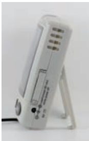
SD card slot