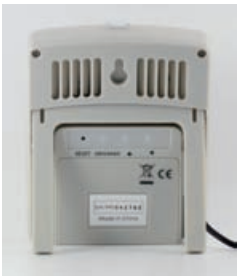
Desktop & wallmount