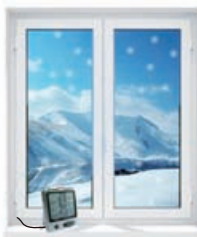
Indoor & outdoor temp.